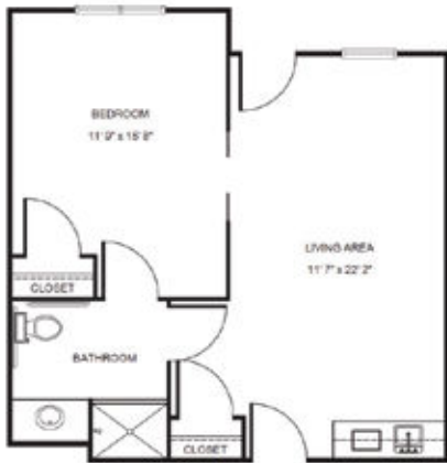
One Bedroom starting at.....$6,855