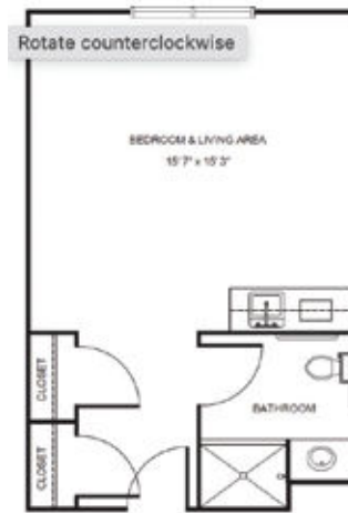
Deluxe Studio starting at .....$6,090