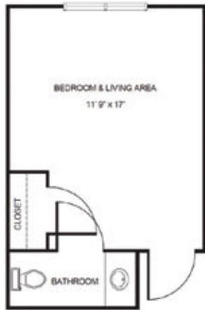
Studio starting at.....$5,435