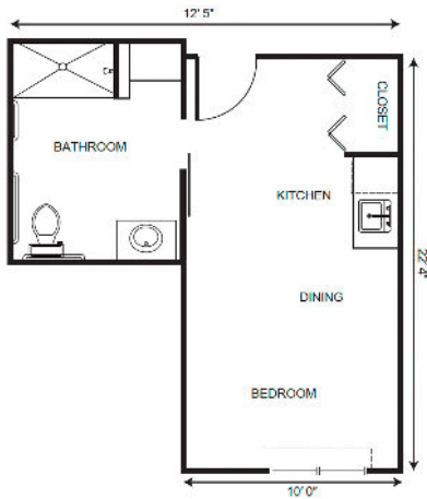
Studio starting at ..... $4,675