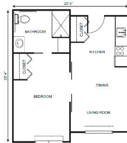
One Bedroom starting at ..... $5,250