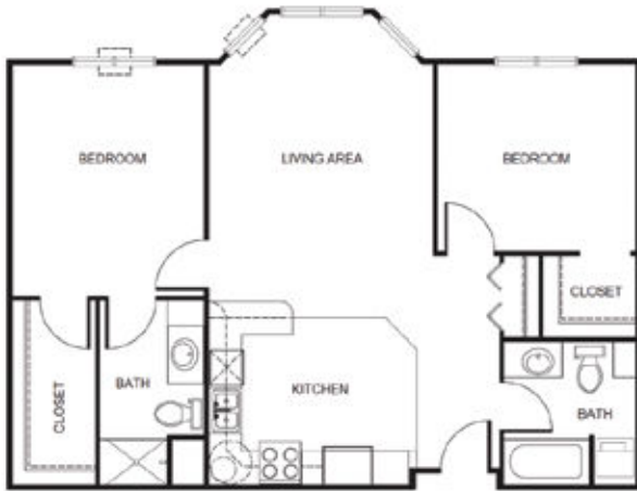
Two Bedroom starting at.....$4,825