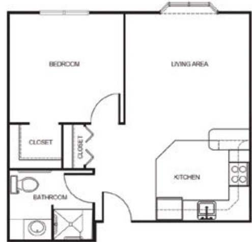
One Bedroom starting at.....$3,825