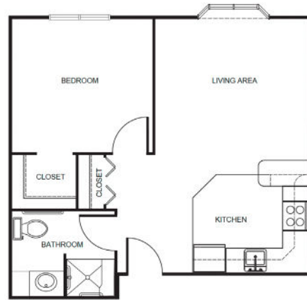
One Bedroom starting at .....$4,100