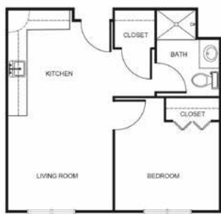
One Bedroom starting at.....$3,125