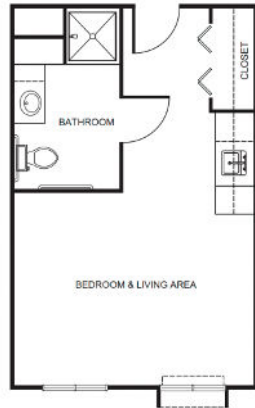
Studio starting at .....$4,450