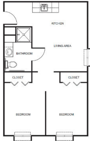
Two Bedroom starting at .....$6,550