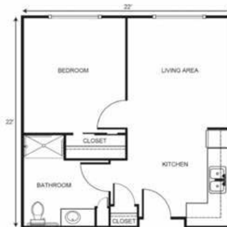
One Bedroom starting at ..... $7,500