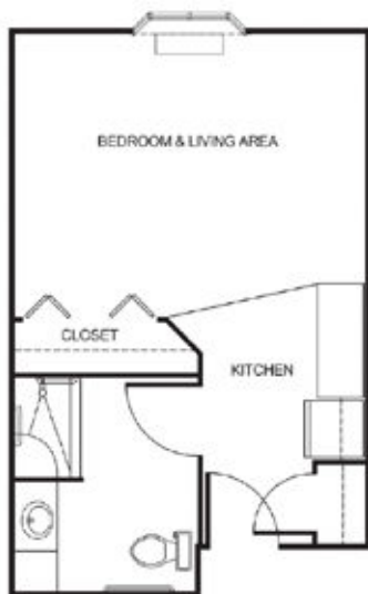
Studio Suite starting at ..... $7,050