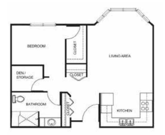
One Bedroom starting at .....$2,900