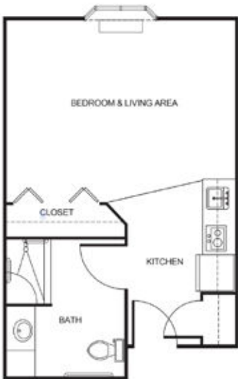
Studio starting at.....$3,275