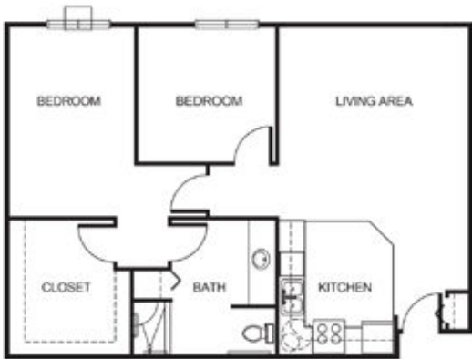
Two Bedroom starting at.....$4,725