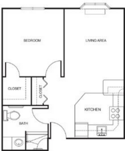
One Bedroom starting at.....$4,325