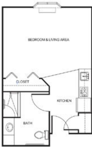
Studio starting at.....$3,450