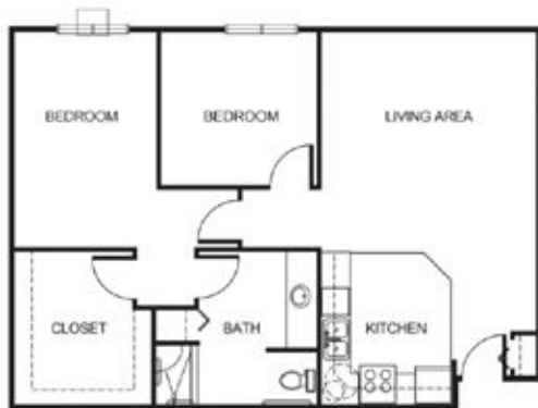
Two Bedroom starting at.....$4,950