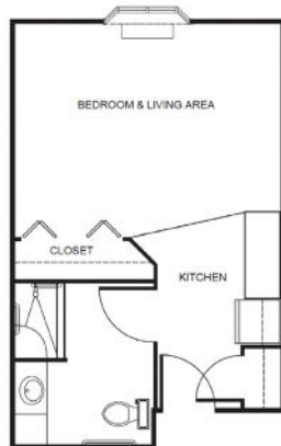
Studio Suite starting at .....$7,425