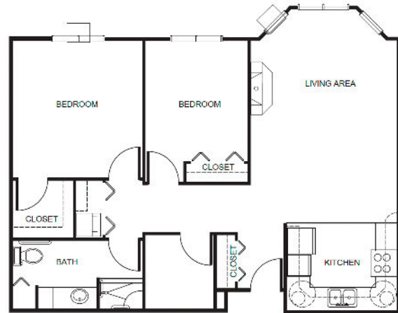
Two Bedroom starting at ..... $3,625