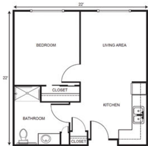
One Bedroom starting at.....$4,550