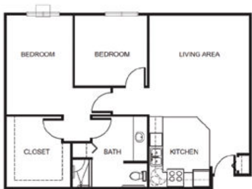
Two Bedroom starting at.....$4,950