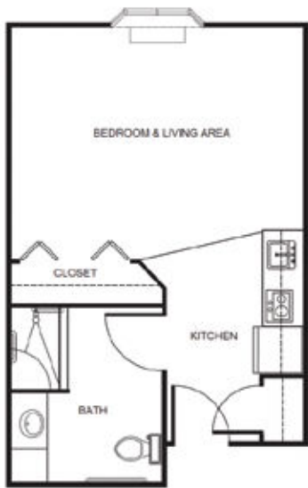
Studio starting at.....$3,450