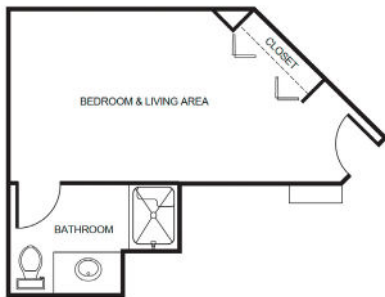
Studio starting at .....$6,825