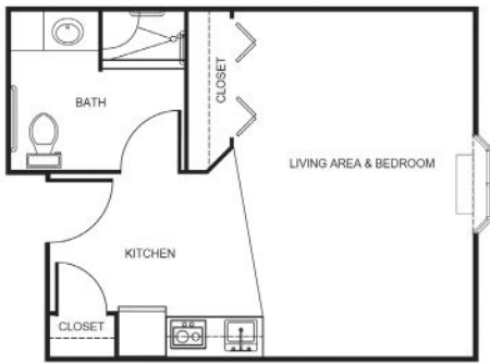
Studio starting at ..... $2,800