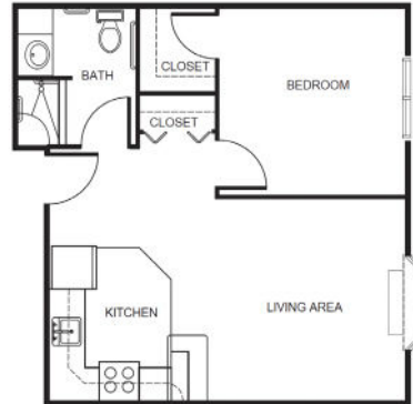
One Bedroom starting at ..... $3,500