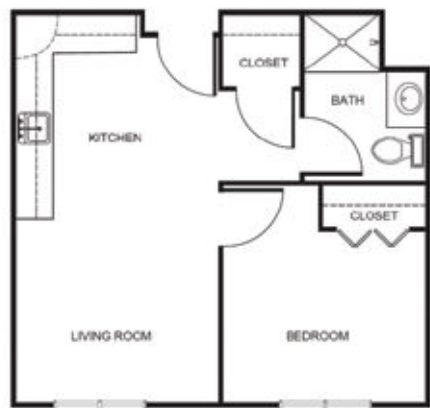
One Bedroom starting at.....$3,300